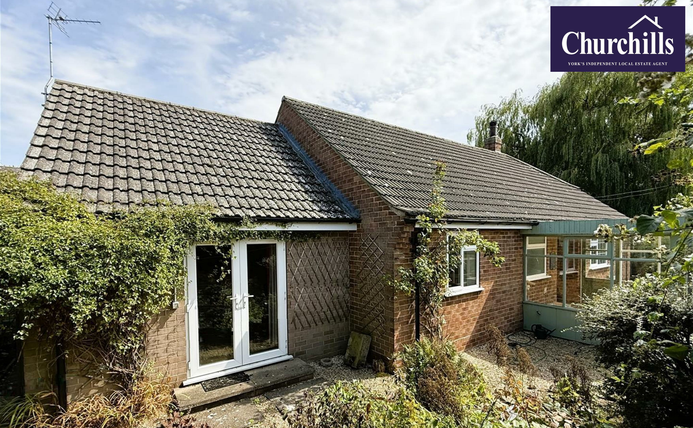
Corner Cottage Main Street Alne York, YO61 1RT £450,000